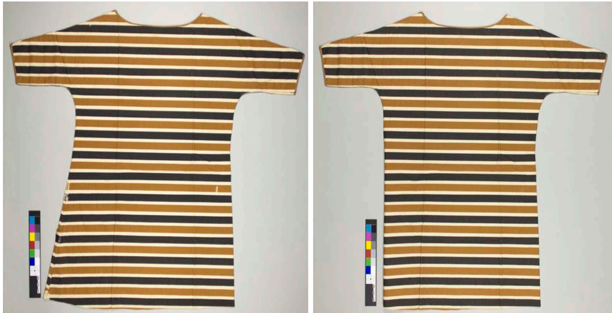
Paper dress from the Atopos Collection Athens (registration number: 2006.02.235). Left: before conservation. Right: after conservation.

The arts organization Atopos Contemporary Visual Culture in Athens, Greece, has collected more than 500 pieces of paper clothing, ranging from medieval Japanese examples to recent paper designs by Issye Miyake and Hugo Boss. The core of the collection, however, consists of paper dresses produced between 1966 and 1968, during the brief but widespread heyday of paper fashion (see Art in Print , Sept–Oct 2014). 1 In conjunction with a 2013 exhibition at the Galerie Stihl in Waiblingen, Germany (an organization dedicated to works on paper), we restored one iconic example. 2